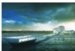
A visualization of the potential future Baltic Park Molo